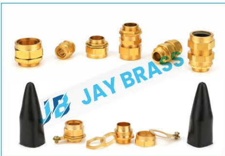
Brass Cable Glands & Accessories