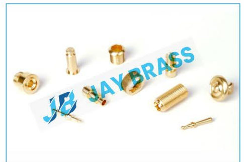
Brass Automotive Components