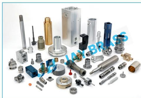
Brass CNC Machining Components