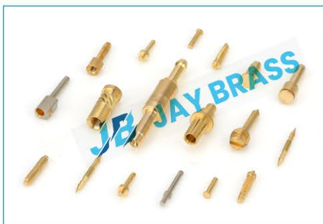
Brass Precision Components