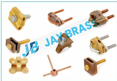
Brass Earthing Accessories